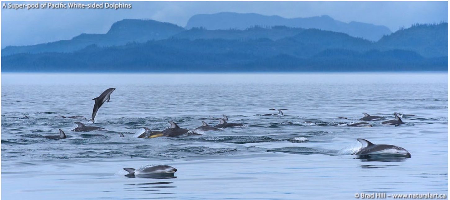
A Super-pod of Pacific White-sided Dolphins

main salon located below deck is a spacious 14' x 17', which seats twelve comfortably while still leaving space to move about freely. There is ample deck space and she is very comfortable under sail. Ocean Light II features all of the extras expected: 19' hard bottom inflatable, six kayaks as well as an extensive library for your enjoyment.