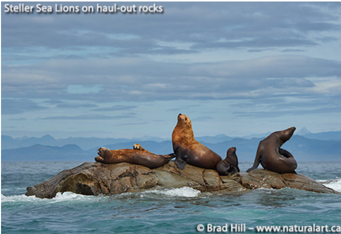
Steller Sea Lions on haul-out rocks