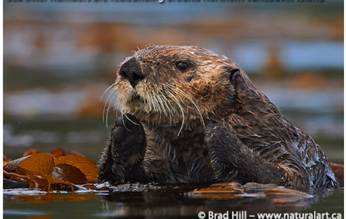
Sea otter numbers are rebounding around northern Vancouver Island

Visiting this area would not be complete without learning